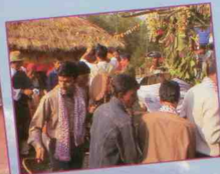
Display of multi ethnic religious practices: