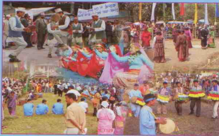
Taste of Multi Ethnic cultural dances- Bhutia, Lepcha, Sherpa, Nepali, Newari, Limboo dances- Dhan-naach, Chyabrung naach, Rai dance, Maruni dance, Sangini dance, Tamang selo, Lakhey naach.