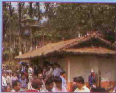
Display of traditional huts- all in action and lively