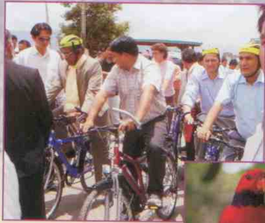
Trekking or bike ride through Barsey Rhododendron Sanctuary.