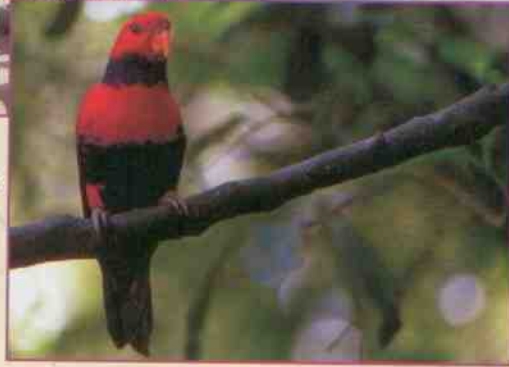
Bird watching : 65 species of birds have been detected by ornithologists.