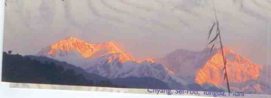
Chiyang, Ser-rou, Tongba, From