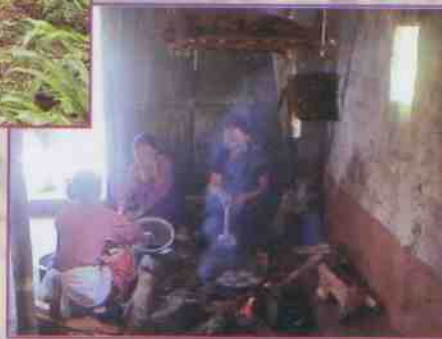
Taste of Traditional Cuisine Chyang, Sel-roti, Tongba, Mohi