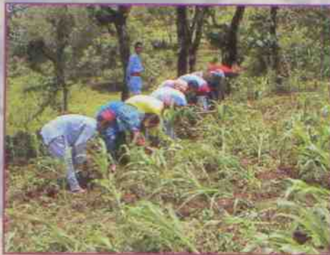
Damkey - Dancing and singing while weeding maize in the field.

Bethi - Transplantation of rice with musical band- Naumati